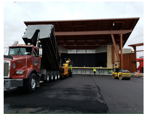
Summerfest • Milwaukee, WI