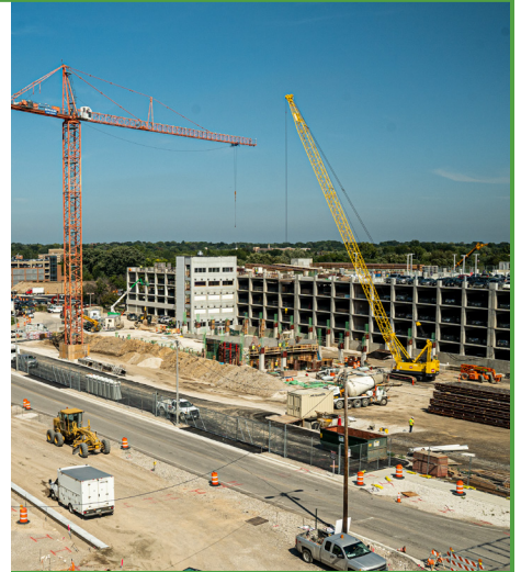
Milwaukee Regional Medical Center • Milwaukee, WI