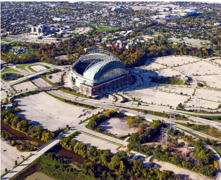
Miller Park • Milwaukee, WI