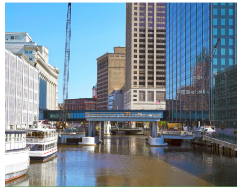
Michigan Street Vertical Lift Bridge • Milwaukee, WI