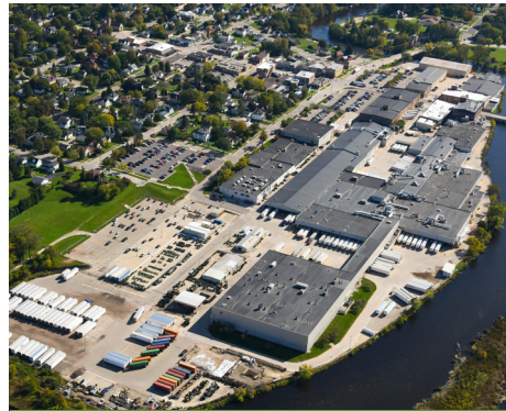
John Deere Horicon Works • Horicon, WI