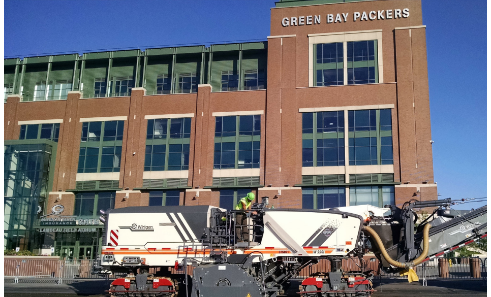
Lambeau Field • Green Bay, WI