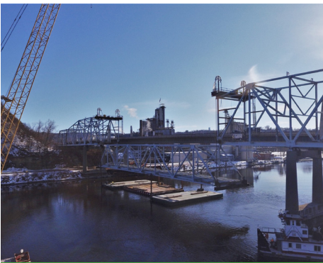
Red Wing Eisenhower Bridge of Valor • Red Wing, MN