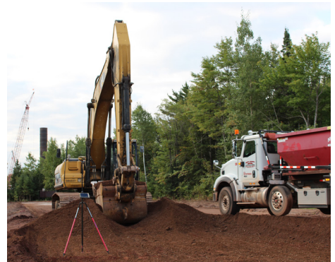
WE Energies - A.J. Mihm/F.D. Kuester Power Plants Marquette County, MI