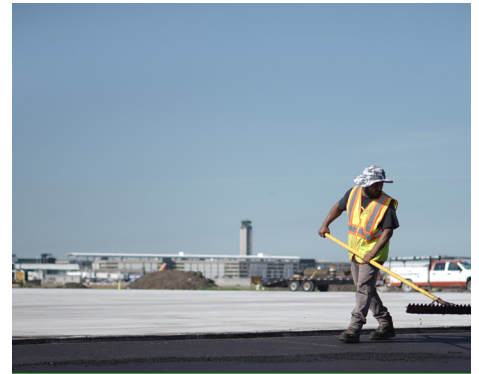
General Mitchell International Airport • Milwaukee, WI