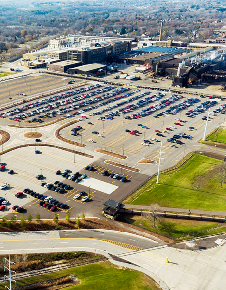
Kohler Company • Kohler, WI