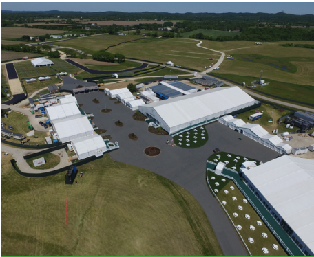
Erin Hills Golf Course • Erin, WI