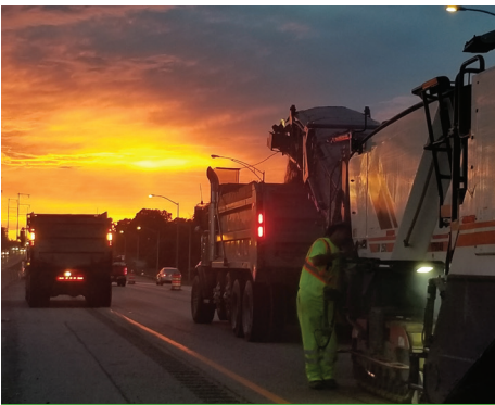
USH 12 - Madison Beltline • Madison, WI