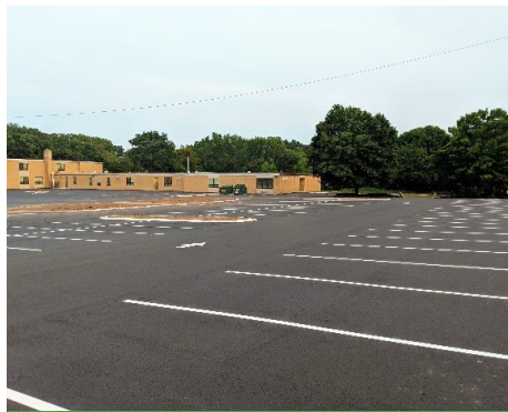
Green Bay Area Public Schools • Green Bay, WI