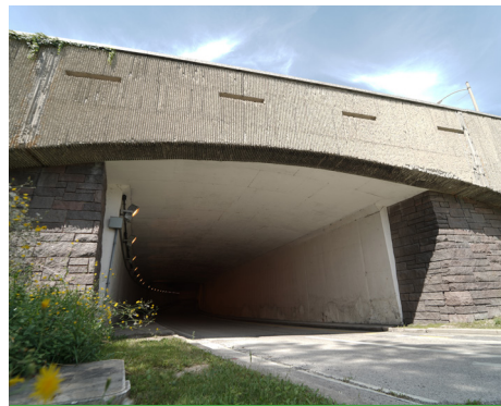
Kilbourn Tunnel Rehabilitation • Milwaukee, WI